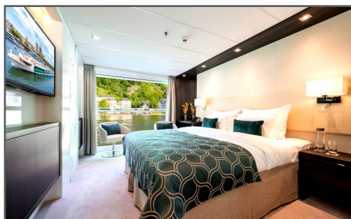
Category B Stateroom