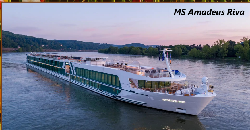
MS Amadeus Riva

With Optional Shore Excursion Package Including SEVEN Excursions! See Inside for Details!