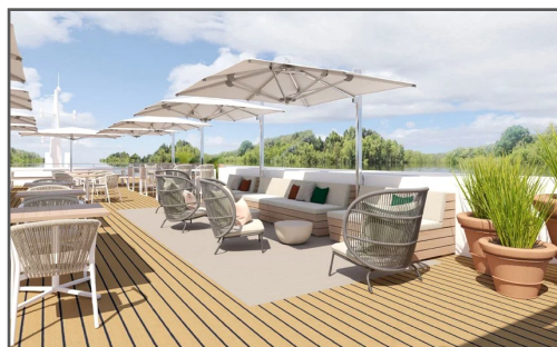
River Terrace Cafe

Amsterdam welcomes you back today. Founded as a small fishing village in the late 12th century, Amsterdam became one of the most important ports in the world during the Dutch Golden Age as a result of its innovative developments in trade. Today, the city has one of the largest historic centers in Europe, with about 7,500 registered historic buildings. The street pattern is largely unchanged since the 19th century. The center consists of 90 islands, linked by 400