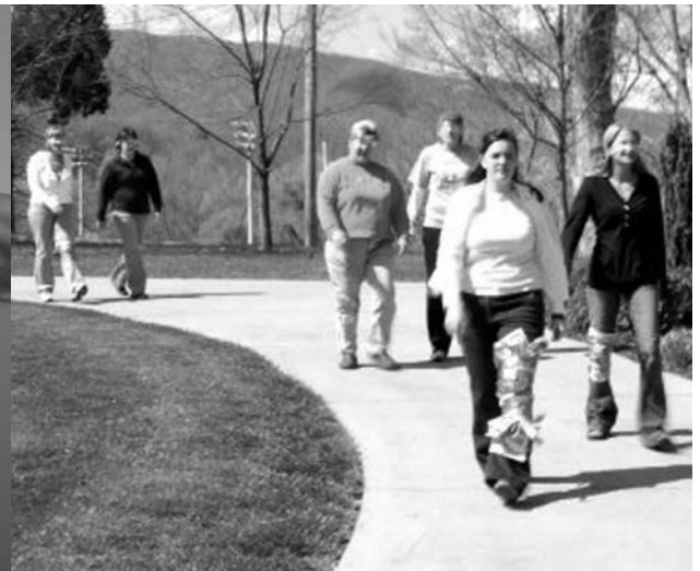
Second year students explore having a slight impairment during class