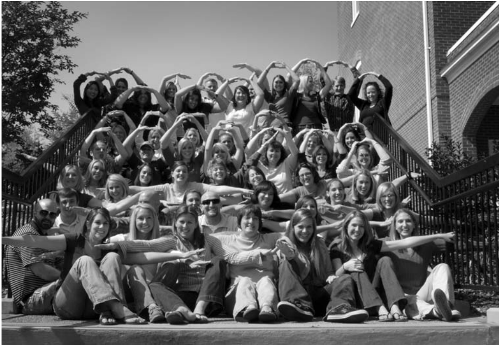
The classes of 2009 and 2010 pose for a photo during the fall semester.

I would like to share with you a few notable accomplishments of our program since it's beginning in 1998. There have been 124 graduates from the program. We currently have a record 78 students enrolled. Alumni provide critical occupational therapy services to undeserved populations across the country from California to Texas to Maine to Florida and of course Tennessee. Our graduates are found in approximately 17 states. The OT faculty have been active in the community with private practices and leading student projects. They have published textbooks and original research in peer-reviewed journals and presented numerous papers and workshops at the local, state and national levels. Faculty have assumed leadership roles at the state and national levels working on a variety of projects and within several different professional organizations.